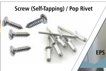
Screw (Self-Tapping) / Pop Rivet