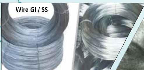
Wire GI / SS