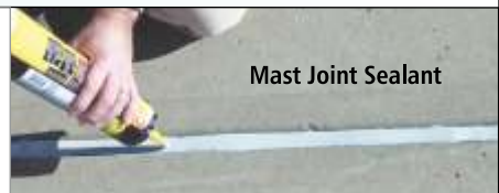
Mast Joint Sealant