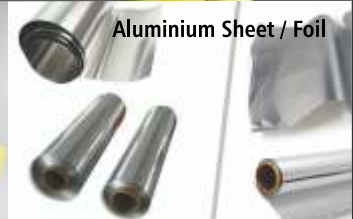
Aluminium Sheet / Foil