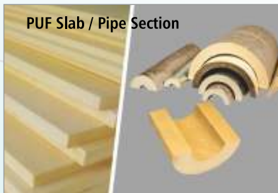
PUF Slab / Pipe Section